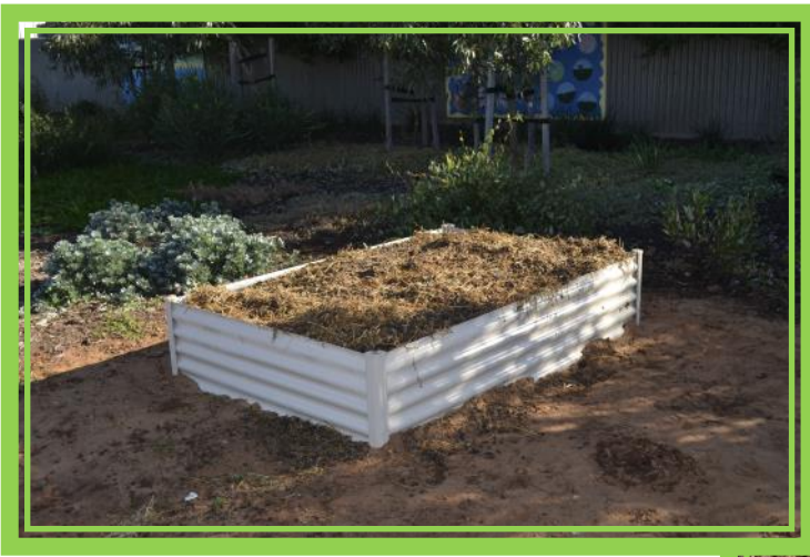
Miss Every's class are currently preparing 4 garden beds for winter vegetable planting. Thanks to Parents and Friends for the donation of the fantastic garden beds.