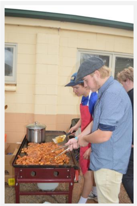
Year 10 and 11 students working at the Business and Enterprise Yiros stand at the Cleve Show.